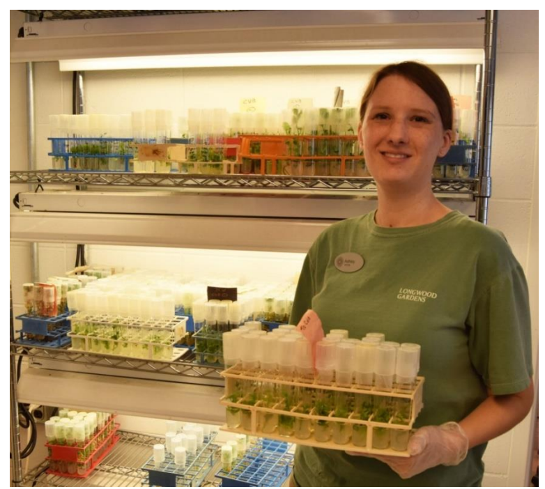
Research Specialist (and former intern) in the Horticulture department at Longwood Gardens.

All of the women in Women in Science started out doing something they loved. They asked questions and continued exploring.