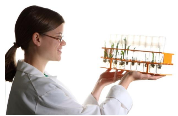
Longwood Gardens Student in Plant Research area