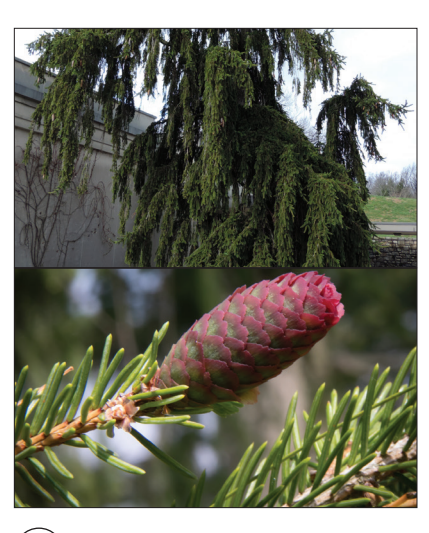
Norway Spruce Picea abies