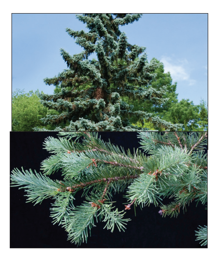
Douglas-fir Pseudotsuga menziesii