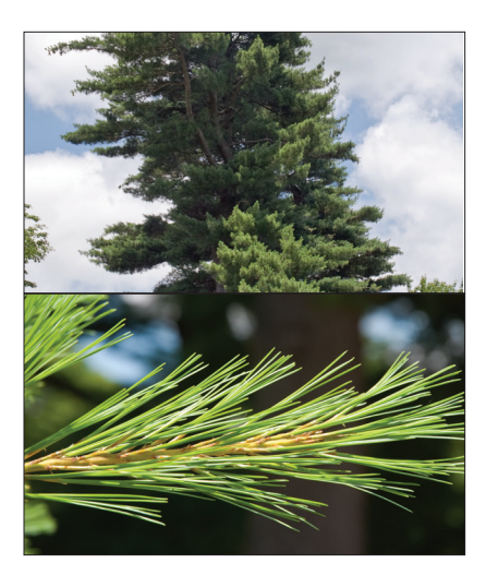
Eastern White Pine Pinus strobus

Below you will find a list of common conifers found in North America. Get outside and see if you can recognize any of these coniferous trees growing in your backyard or neighborhood. Collect pinecones as you search to use for the next activity.