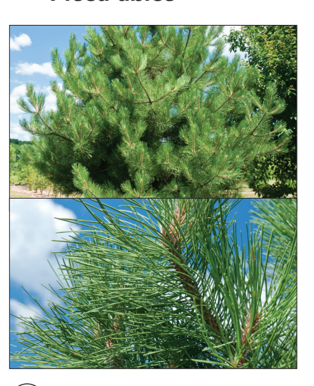
Austrian Pine Pinus nigra