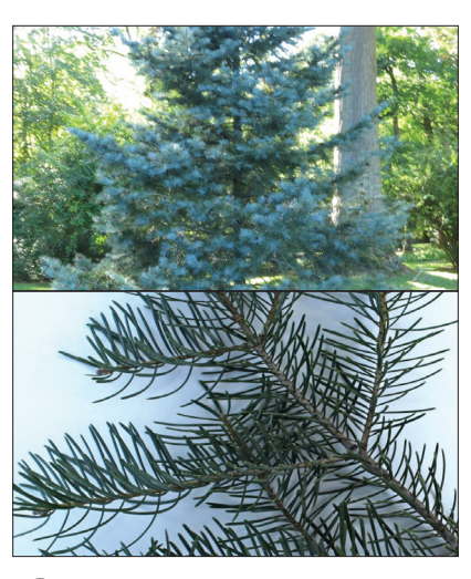
White Fir Abies concolor