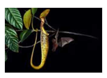
Bat Pitcher Plant Nepenthes hemsleyana

Pollinator: Sunbird attracted by beak-like shape and colorful flower.