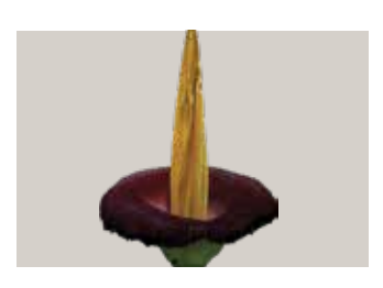
Titan Arum Amorphophallus titanum