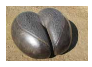
Coco De Mer Lodoicea maldivica

Pollinator: Ants & bees attracted by sap.