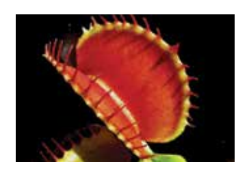
Venus Flytrap Dionaea muscipula