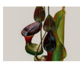
Low's Pitcher Plant Nepenthes Iowii